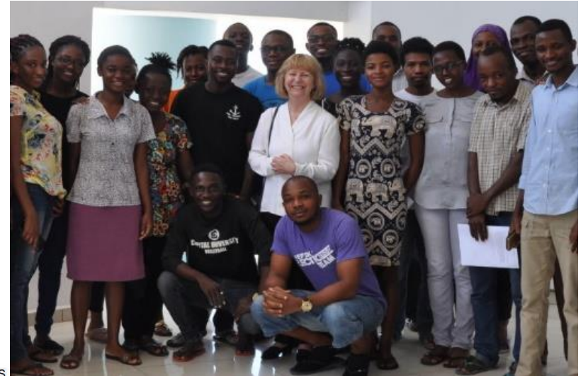
Imperial College's Vice President (International) visiting the African Institute for Mathematical Sciences in Ghana, May 2018.